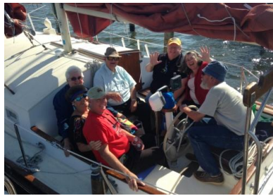
October – GAIN 13

A pastor shared the following about his time at GAIN: “During the retreat I tried to leave my phone in the room as much as possible and the Lord laid it on my heart to just get rid of the smartphone all together so it wasn’t as much of a time killer and distraction. So as soon as we left the island, I purchased a flip phone and ditched the busyness of the smartphone. My kids tell me I look like an old man with a flip phone; but it has been a simple, yet, great spiritual decision!”